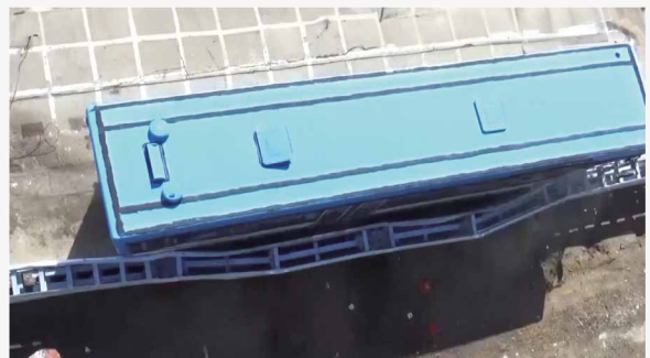
Impact velocity 67 km/h