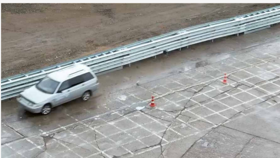
Impact velocity 90 km/h